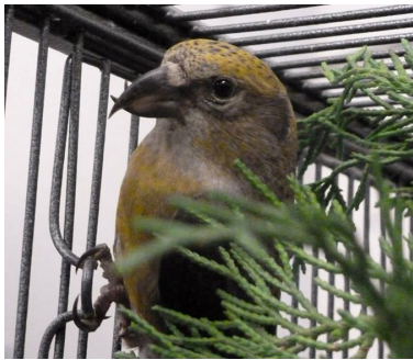
This Crossbill was found unable to fly in Abbots Wood due to concussion

If you are unable to approach the bird then monitor it carefully for any signs of illness or injury and call for advice if a bird is grounded for an extended period of time.